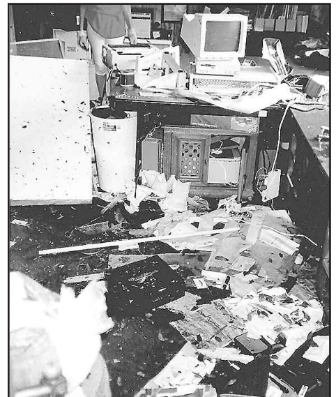
My office after the storm

Other articles of national importance can be viewed at Ernie's website at < www.sochin.com >.