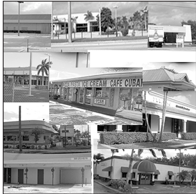
Closed businesses in the community

Maybe we don't need a new car every year with a voice command GPS, 360 degree camera monitor and an auto parking sensor. Maybe we don't really need a smart phone that takes and sends movies as we